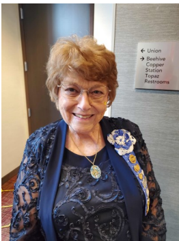
Governor Harriett Beck