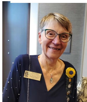
Governor Elect Alice Helle