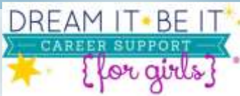
Roosevelt 8th graders Dream Boards